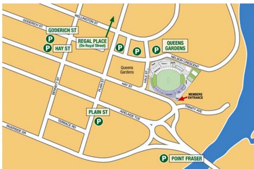
Local parking availability