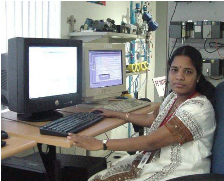
Figure 3. Honeywell Fieldbus Test Engineer in Bangalore, India

Honeywell maintains two separate systems specifically devoted to testing Fieldbus devices with Experion PKS, each having a different focus. Our primary facility for detailed device testing is the Fieldbus Interoperability Test Lab in Bangalore, India, facility run by Honeywell Technology Solutions Lab (HTSL). One of our primary test engineers is shown in Figure 3 with the system in the lab. The lab is also shown in Figures 4 and 5. Previous discussions about test methodology apply to this facility. Testing of an average Fieldbus device can require as much as a week of effort, but this can vary considerably from device to device depending on number of function blocks and complexity of the device. As one would expect, this also varies depending on issues encountered.