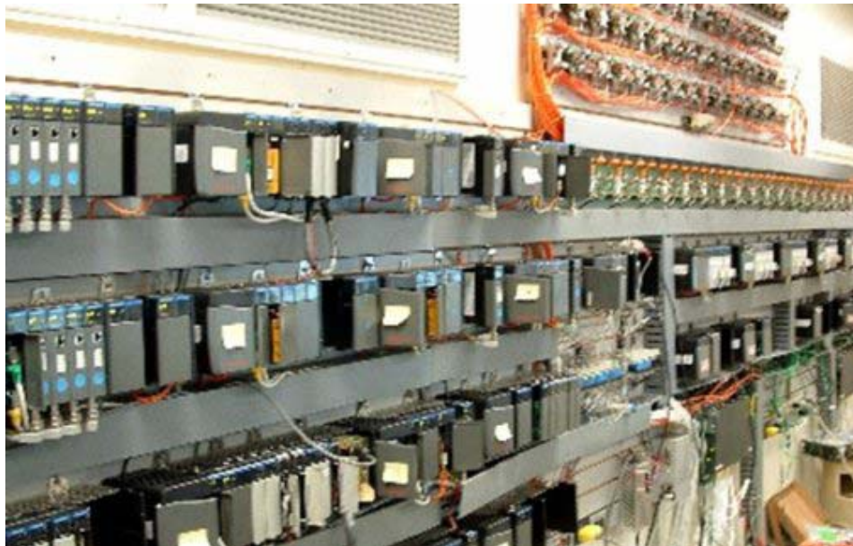
Figure 6 & 7. Honeywell Large System Test Lab in Ft. Washington, PA