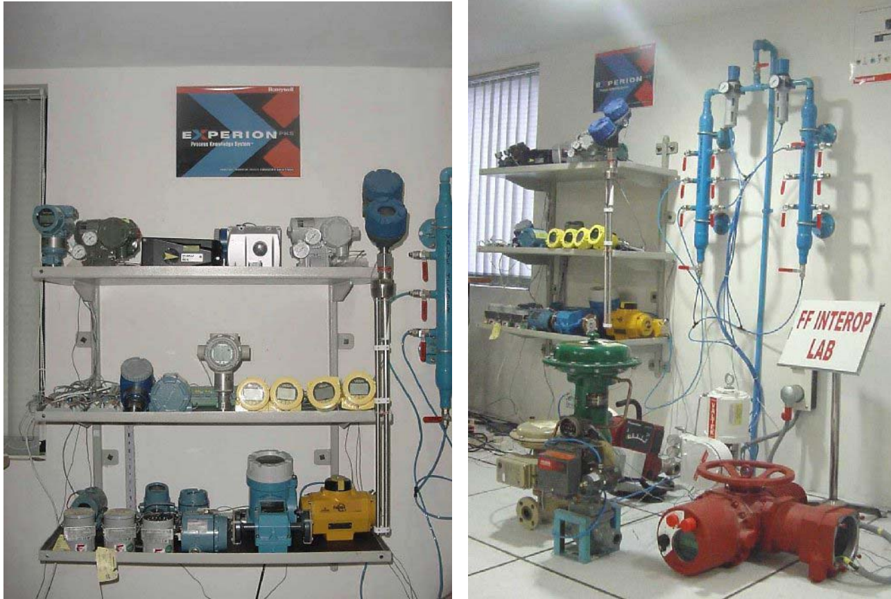
Figure 4 & 5. Honeywell Fieldbus Interoperability Test Lab in Bangalore, India